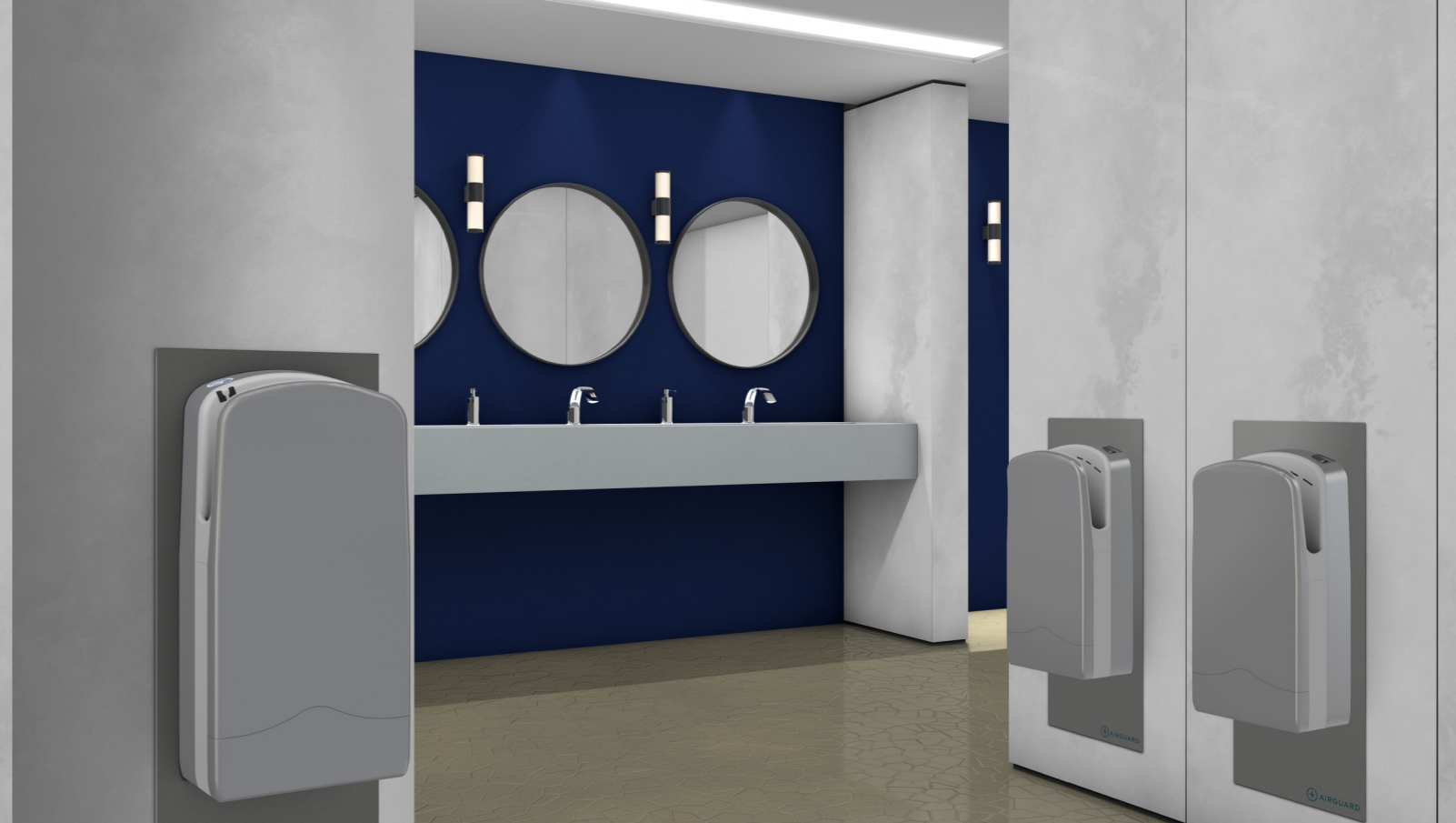
S7 Triple-Blade with AirGuard