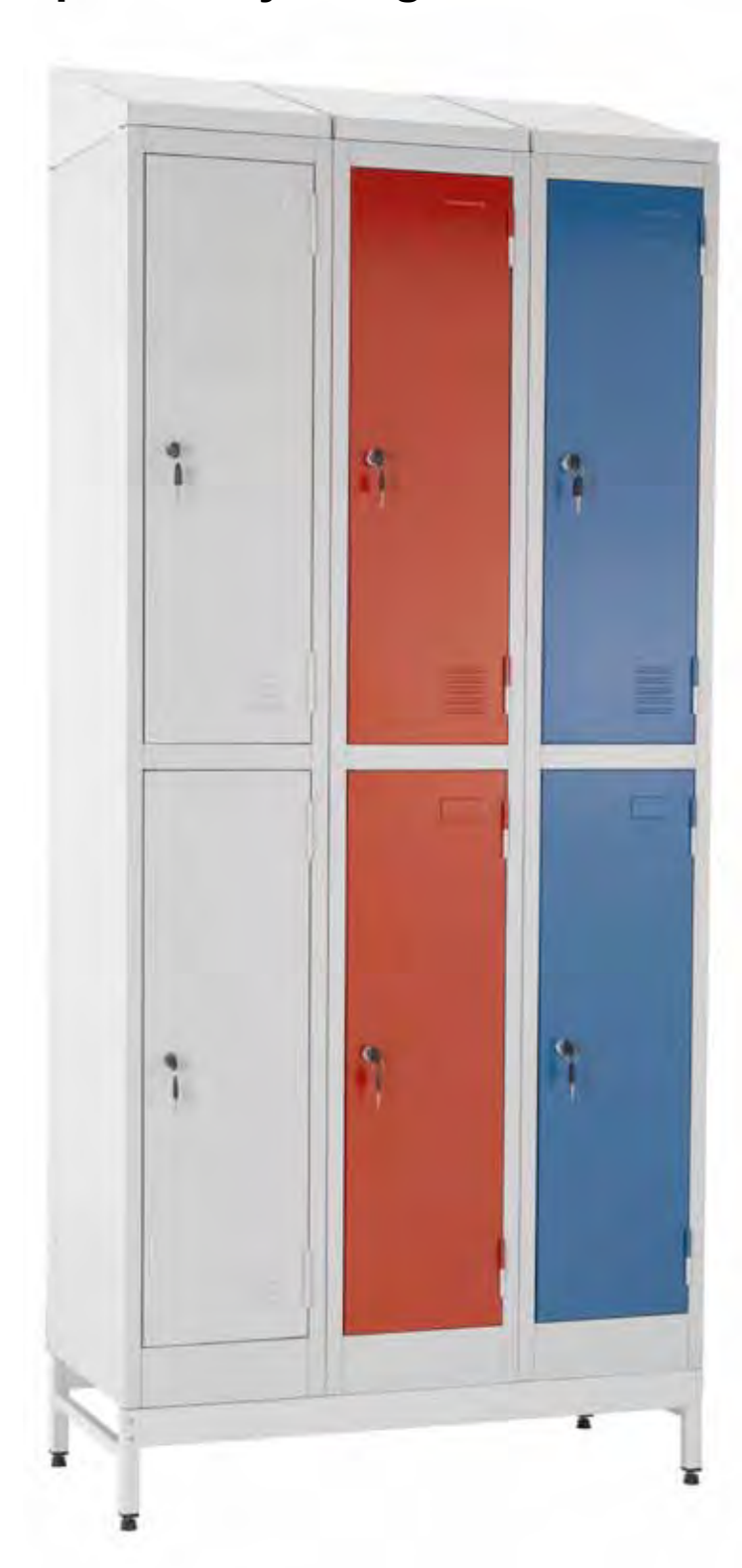
Padlocks - both combination and keyed