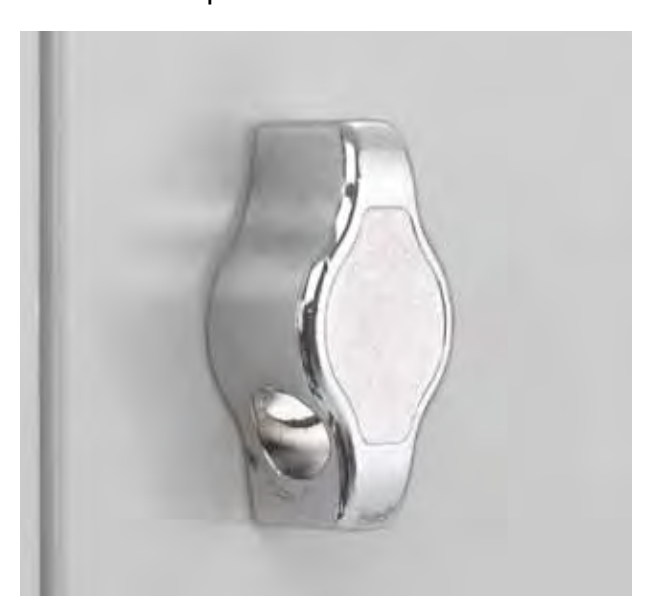
The shackle bar of the padlock should be between 5 - 7mm.

The swivel catch acts a handle and can be easily padlocked with a standard or combination padlock.